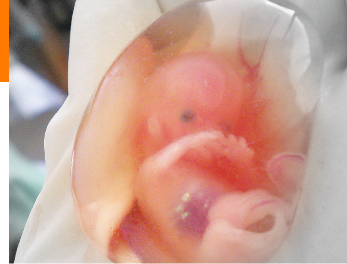
Ten week fetus

5. Even at the end of the second trimester a fetus cannot survive outside the woman’s uterus without special medical measures. Its brain is still very unformed. Its lungs are not ready to take in air. It is still very much a part of the woman’s body and completely dependent on her bodily processes. It is not a human being until it is born, and takes its first breath.