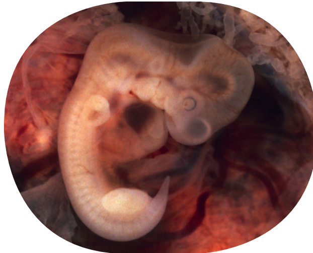
Five week embryo

4. By the third month of pregnancy the embryo, now called a fetus, starts to look a little more “human” as it grows arms, legs, sex organs, fingers, and toes. It is undergoing a lot of changes, but inside, its internal organs, muscles, skeleton, and nervous system are still very undeveloped. The whole thing is still only about 60mm long, that is about 2-1/2 inches.